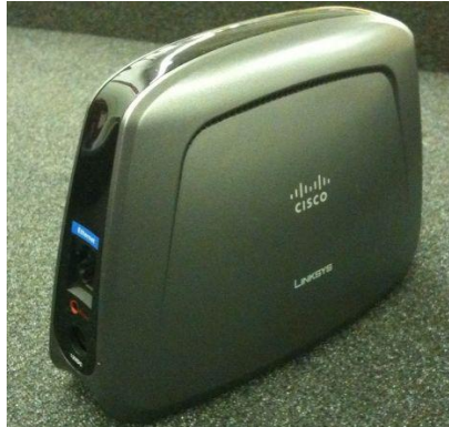
Figure 1: Linksys WET610N Radio

The WET610N must be configured manually for use on the playing field at an FRC event.